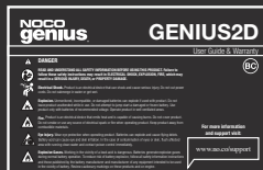
Userguide and warranty